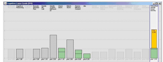
Figure 2: Visualization of the goals on the cognitive layer. Dark gray and green goals are active. The framed goal is currently executed. The yellow staff represents the additional task switch costs.

domain expert. In addition, priorities of goals increase over time if not executed. Implicitly, temporal deadlines are modeled in this way. If, while executing a goal, another goal has a distinctively higher priority than the current one, the execution of the current goal is stopped and the new goal is attended to. This decision depends on the priorities of the goals and is extended by the parameter Task Switching Costs (TSC), which determines the difference the priorities need to have to halt the execution of a goal to select a different goal to be executed. TSCs are described extensively in literature (e.g. Jersild, (1927); Rogers & Monsell (1995)). The higher the TSC is, the higher the priority of another goal needs to be to switch to that goal. To determine whether a goal should be interrupted and a different goal should be executed, the TSC is added to the current task priority. Only if a priority of another active goal is above this threshold, this other goal is chosen to be executed. For a visualization of the goals see Figure 2.